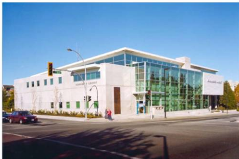
Surrey Public Library's Semiahmoo Branch -Canada's first “green” library