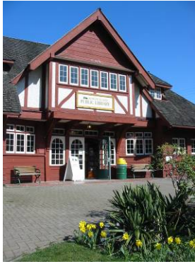
Bowen Island Public Library